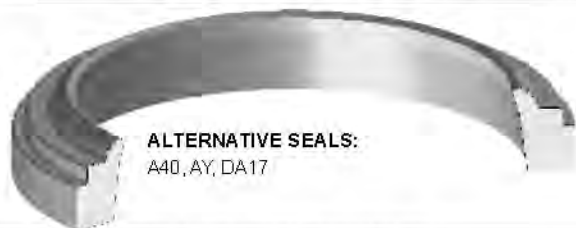
ALTERNATIVE SEALS: A40, AY, DA17